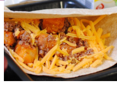
Beef & Potato Wrap