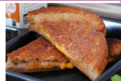
Grilled Cheese & Tomato Soup