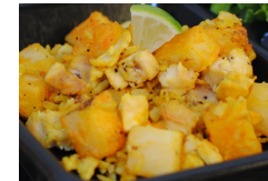
Chicken & Potato Pilaf