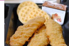
Chicken & Waffles