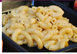
Macaroni & Cheese