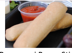
Pepperoni Bosco Sticks