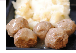
Turkey Meatballs with Gravy