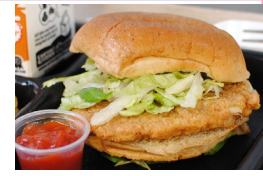
Chicken Patty Sandwich