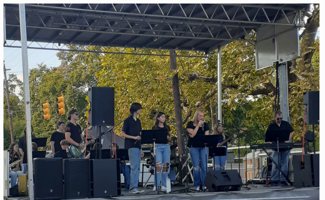
OPS JAZZ BAND

Our Volleyball, Men's Soccer, and Cross-Country teams have all kicked off OPS Athletics with a bang! Our Middle School Volleyball team are champions in the TNAC! Our Men's Varsity Soccer team beat Vance Charter 3-2 at VC's own Homecoming game and are fierce competitors in their conference. Our Cross Country teams have taken off and have had many runners place in the top 5 at multiple meets, taking first place in quite a few! LET'S GO GRIFFINS!