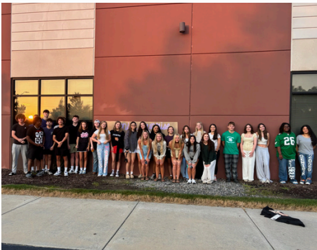
EVENT HOSTED BY SGA