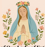
Feast of Our Lady of Fatima

10am School Mass & May Crowning 1pm dismissal