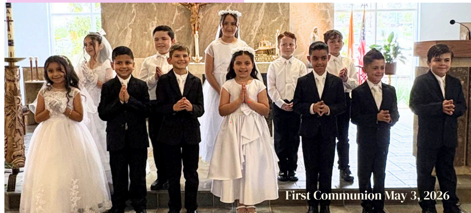
First Communion May 3, 2026