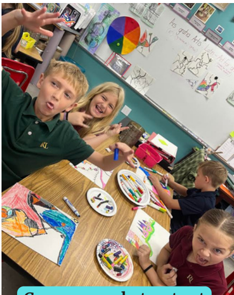
Crazy over abstract art with oil pastels!