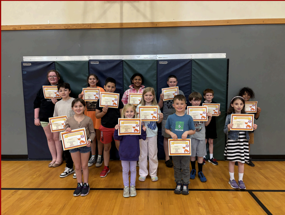
Students recognized for going above and beyond with their kindness and hard work .