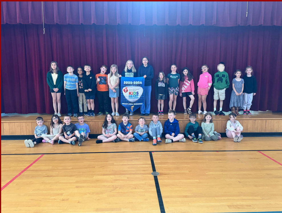
Heart heros that help raise around $4,000.00 for the American Heart Association