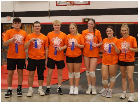
The Volleyball Marathon Champions!