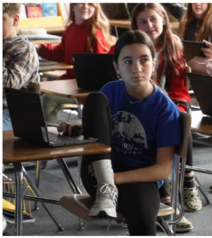
The 6 th graders compete in Kahoot.