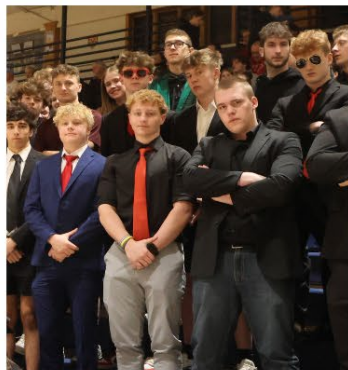
Our student section dressed for business.