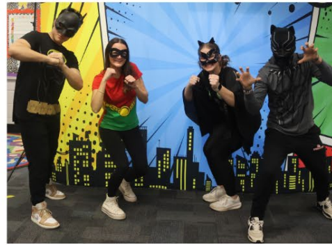
Senior high superheroes saved the day at Reading Night!