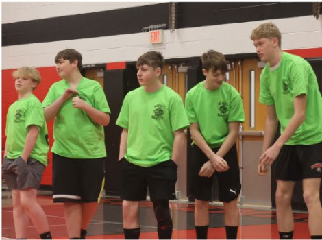
Our middle school boys preparing for a dodgeball game.