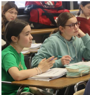
Math class in the sixth grade.