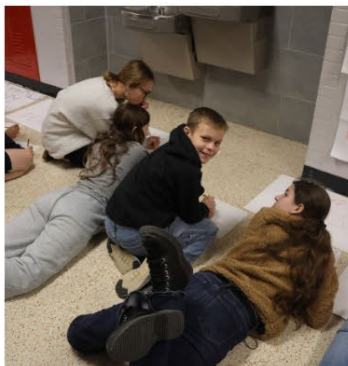
6 th grade working hard on their projects in the hallway.