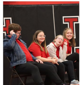
Lots of laughs at the bocce ball meet.